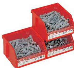
Stacking box ST