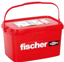
S in bucket